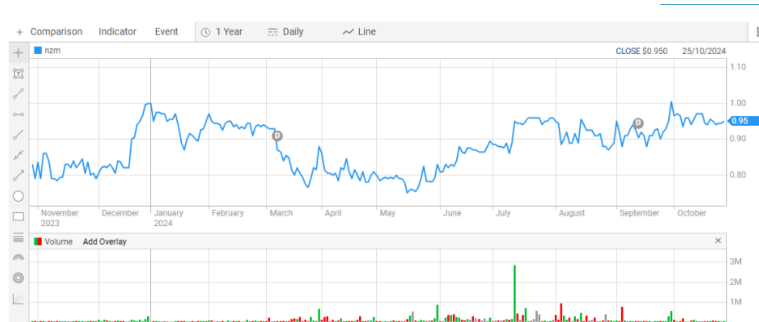
Figure 1: NZM share price from October 2023 to October 2024