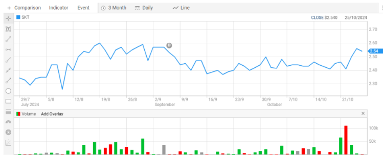
Figure 2: SKT share price from October 2023 to October 2024

Source: ASX. Sky share price and company information for ASX: NZM. https://www.asx.com.au/markets/company/SKT (accessed 27 October 2024)